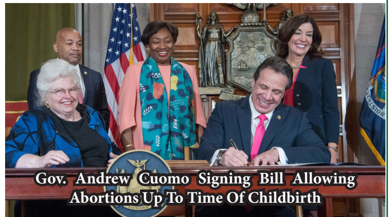
Gov. Andrew Cuomo Signing Bill Allowing Abortions Up To Time Of Childbirth

Sadly, the United States is not the worst country in this regard. According to statistics provided by the pro-life website Abort 73 , in the span of just four years, 35 million abortions were performed in Asia. In Africa 8.3 million unborn infants were put to death; in Latin America, 6.5 million; in Europe, 4.4 million. Between the years of 2010 and 2014, there were over 56 million abortions done annually worldwide (Worldwide Abortion