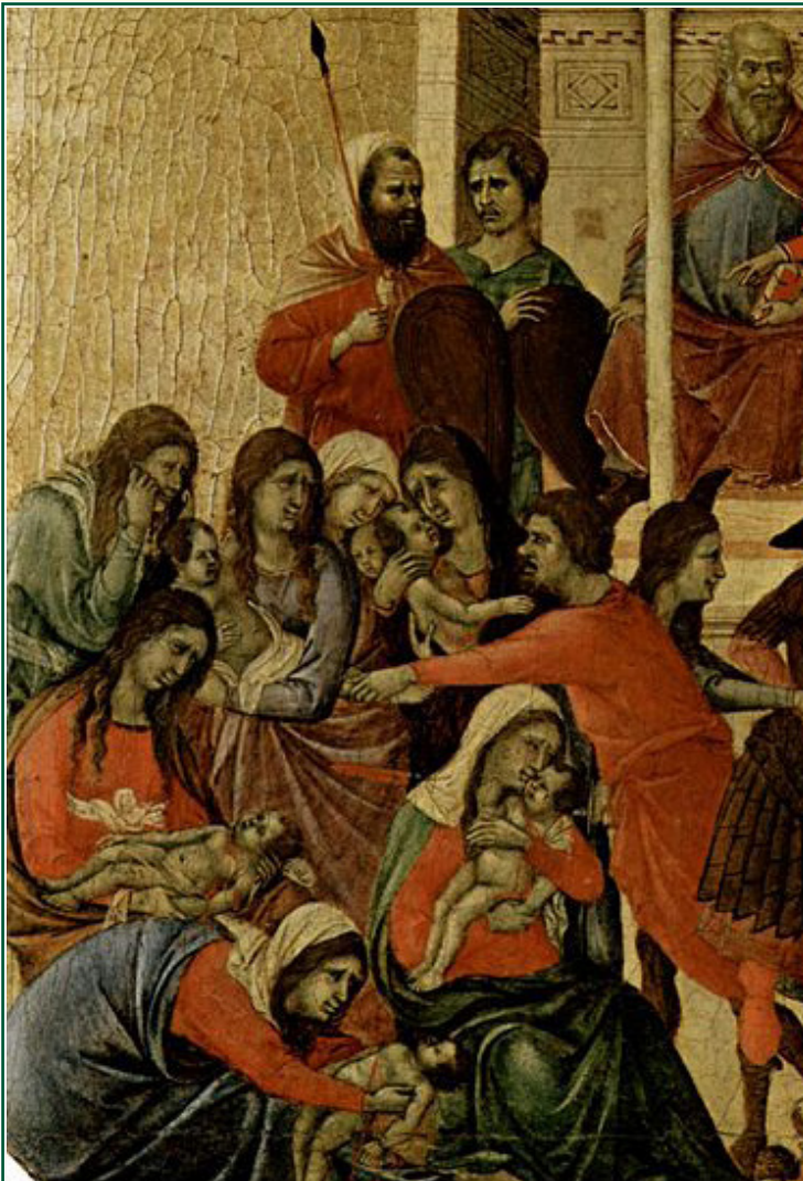
—The Massacre of the Innocents. Duccio di Buoninsegna. 1308-1311.

By now most of you have surely heard of the terrible evil that took place in New York one month ago on January 22. The New York governor Andrew Cuomo, a self-professed Catholic, signed a bill into law for New York State that allows a woman, or even a girl, to have an abortion all the way up to the time of childbirth. While the bill does contain certain “stipulations,” still, when all is said and done, the expecting mother can kill her unborn child for any reason whatsoever. This is not just monstrous; it is completely diabolical. What is more, the applause and celebration of the lawmakers that ensued after the passing of this inhumane law was truly a scene from hell, for to applaud and celebrate murder is something only Satan could instigate.