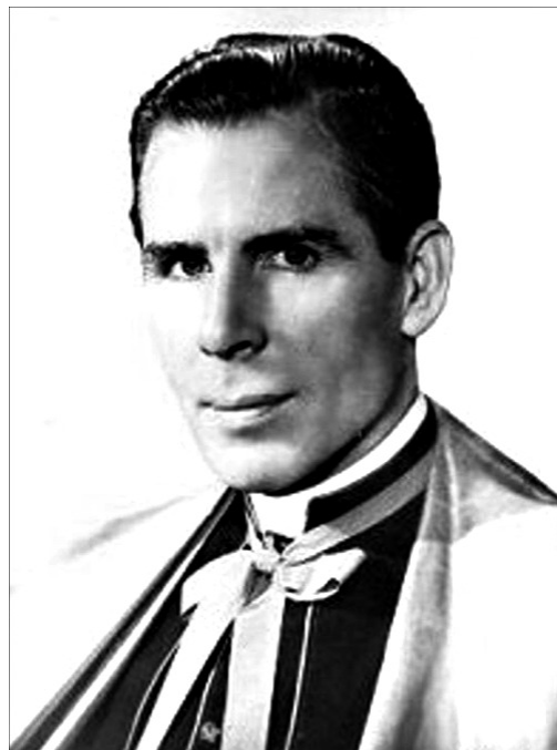
—Archbishop Fulton J. Sheen 1895-1979.

punishments inflicted upon murderers. The practice of abortion, therefore, ceased wherever Catholicism became established. Consequently, during the middle ages it was rare, as was divorce. However, like divorce, abortion has again become a grave danger to society.