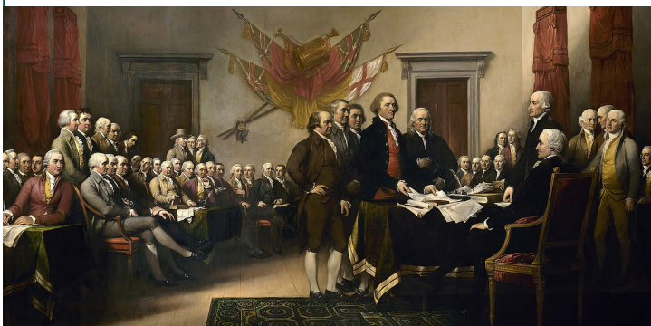
— John Trumbull, Declaration of Independence, 1819.

The Israelites were terrified at the prospect of war, but they nonetheless refused to surrender. Instead, they fervently besought Almighty God to spare them