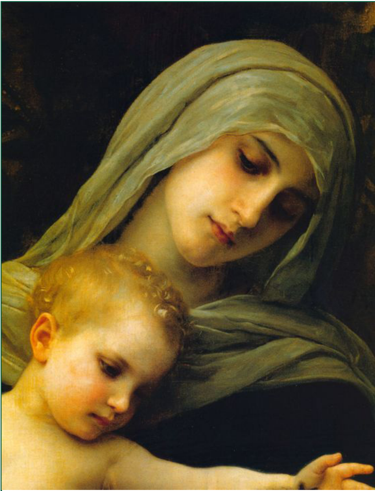
—William-Adolph Bouguereau. Madonna and Child with Saint John the Baptist . 1882. Cornell University, Ithaca, New York.

on God and has, so to speak, raised her fist to God's face by her immoral and unjust laws. As a result, American society has sunk lower and lower into the depths of degradation and is in grave danger as was Bethulia at the time of Judith.