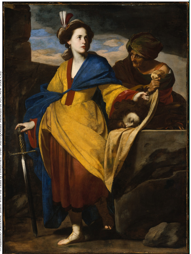
—Massimo Stanzione, Judith with the Head of Holofernes , 1640, Metropolitan Museum of Art, New York City.

The Israelites welcomed her with great joy, and this joy quickly turned to exultation when Judith showed them the head of Holofernes. At first light the next morning, the Israelites, inspired with renewed courage, attacked the Assyrian army. The surprised Assyrians went immediately to inform Holofernes of the attack.