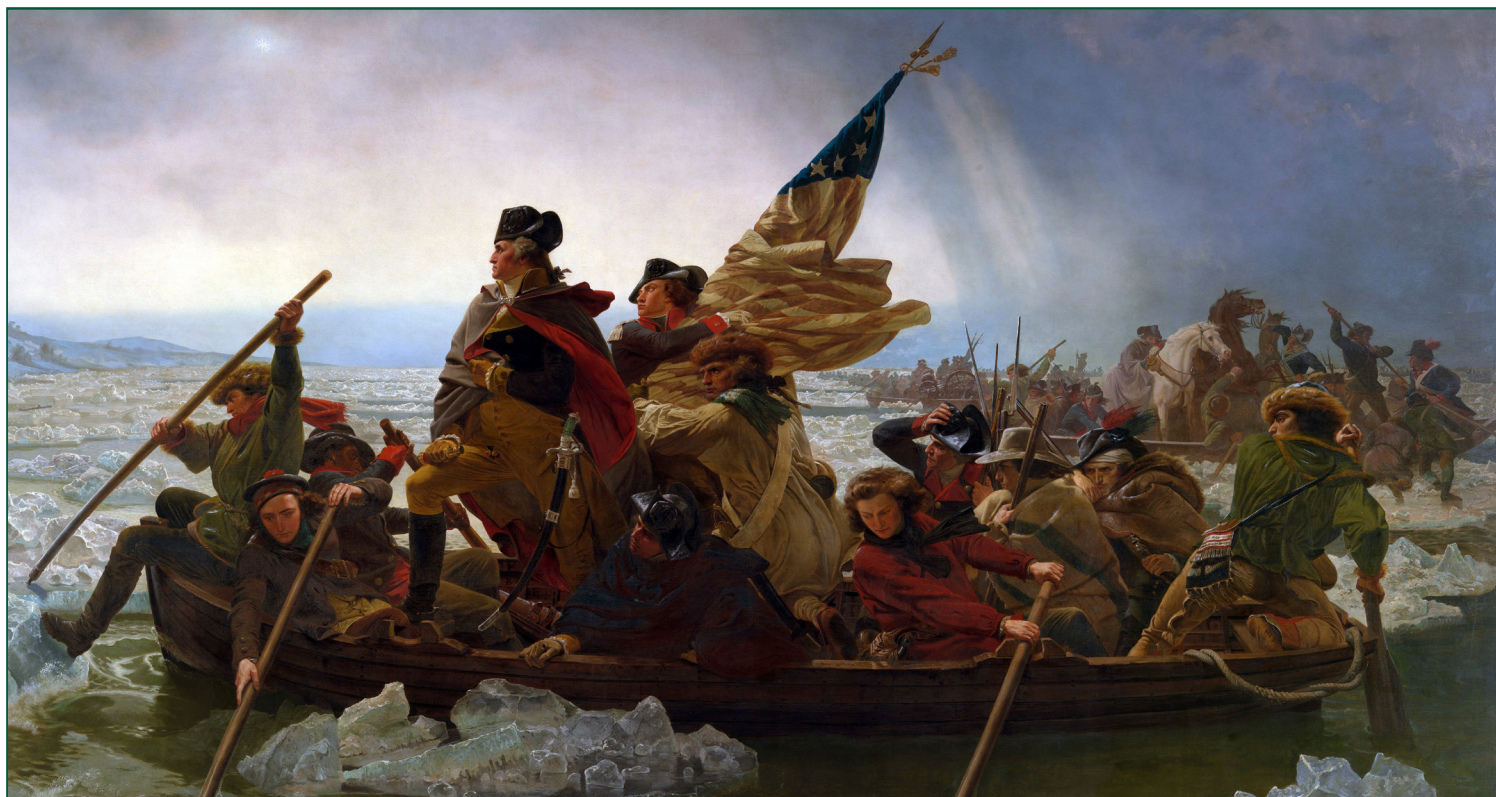
—Emanuel Leutze. Washington Crossing the Delaware . 1851. Metropolitan Museum of Art, New York City.

Finding their general dead in his tent, they began fleeing in panic and fear.